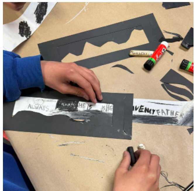
STUDENT ARTWORK EXAMPLES, PAPER, WAX CRAYONS AND CHARCOAL. 2024.

https://www.instagram.com/nellartist/?hl=en